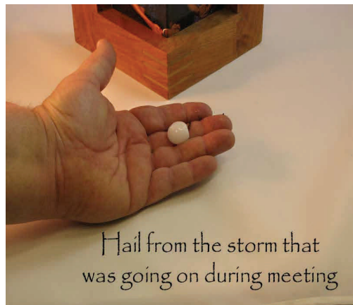
Hail from the storm that was going on during meeting