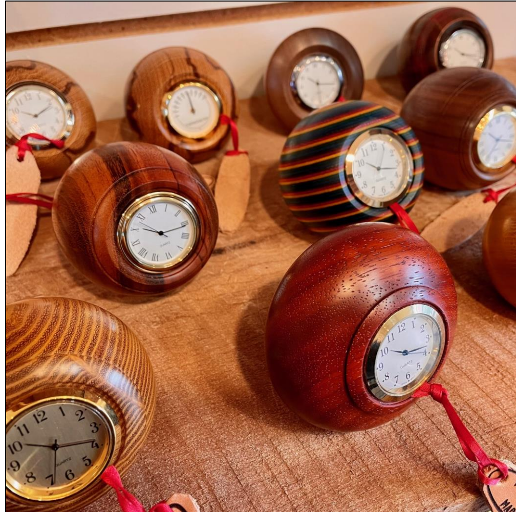
Right – Samples of Paul's desk clocks