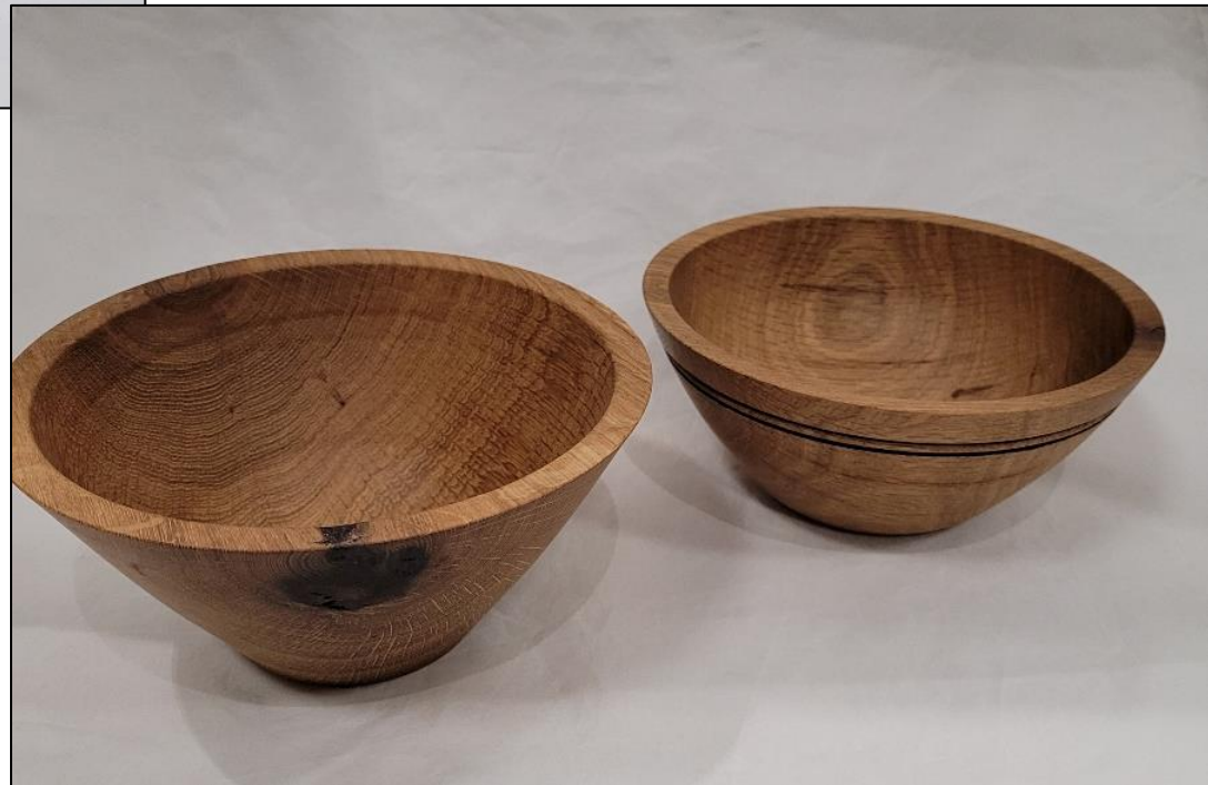
Below - Bruce Metzdorf