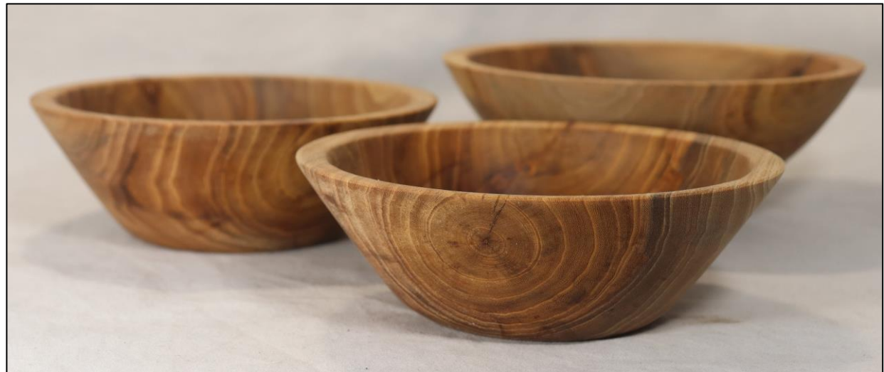
Below - Unknown artist