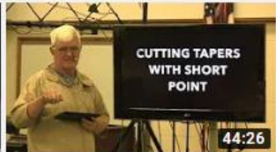
Analyzing the Skew