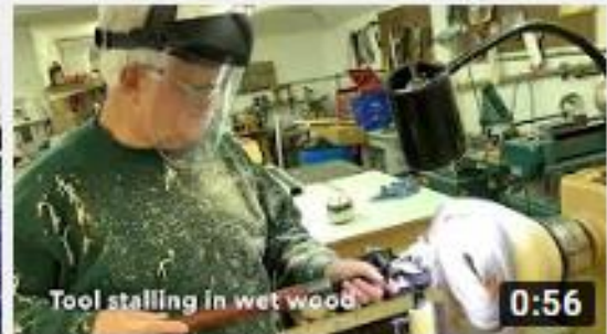
Lubricate the coring groove!