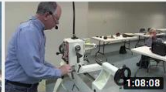
WAYS OF MOUNTING WOOD BLANKS