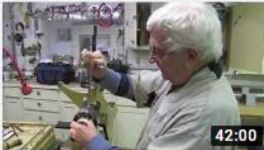
Easy threading of boxes and lids