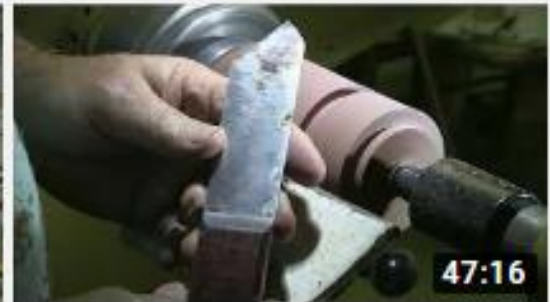
Turning End Grain Lidded Boxes