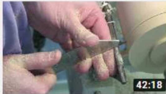
TURNING A BOX WORTH ITS "SALT"