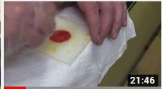
Easy Finish for Pens, Bottle Stoppers and Boxes