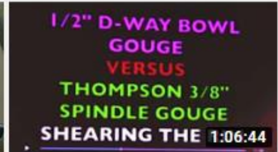
Using Spindle Gouges on Bowls