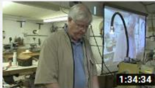
Designing and Turning Plates and Platters