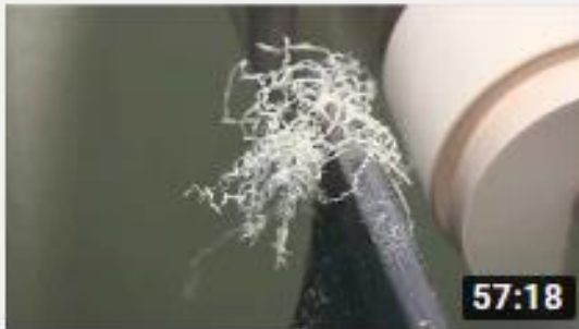
Turning a inlay in a inlay in a inlay