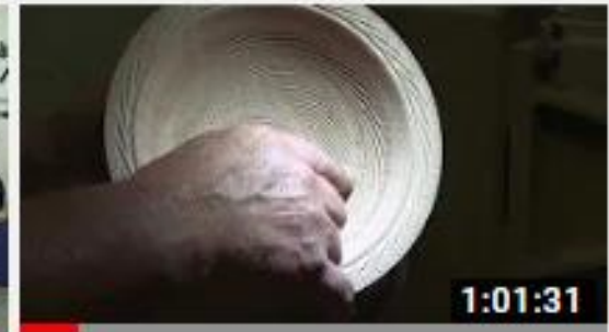
Secrets of Successful Texturing on Platters and...