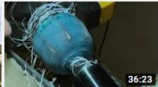
Turning a Turner's Star in Colored Resin