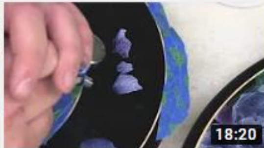
Pushing Iridescent Paint on Bowl Rims