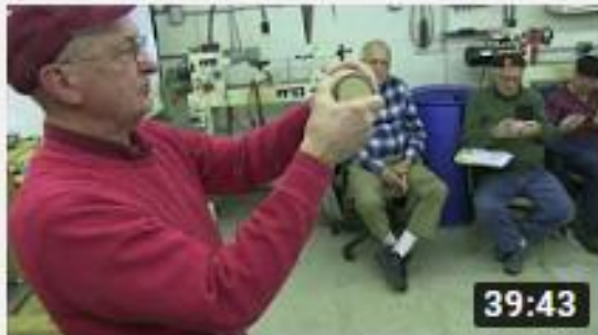
Beautiful Braclets from the lathe