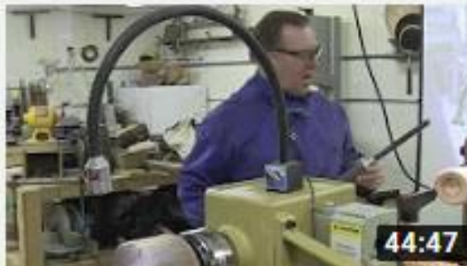
Different Cuts for Different Forks