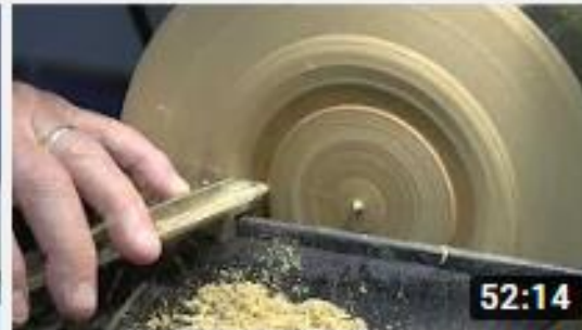
3 Major Bowl Grinds for the Interior of bowls.