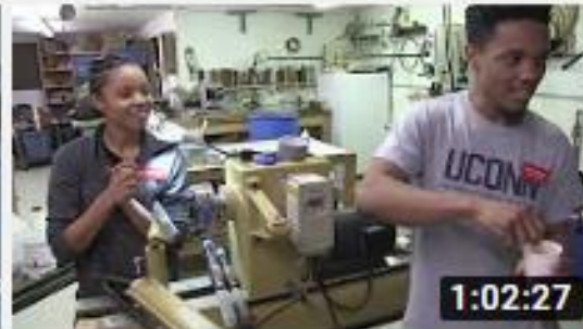
Threading Resin on Boxes