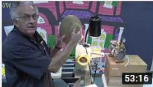
Using a Vacuum Chuck