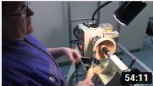
Texturing and Chattering Wood Surfaces