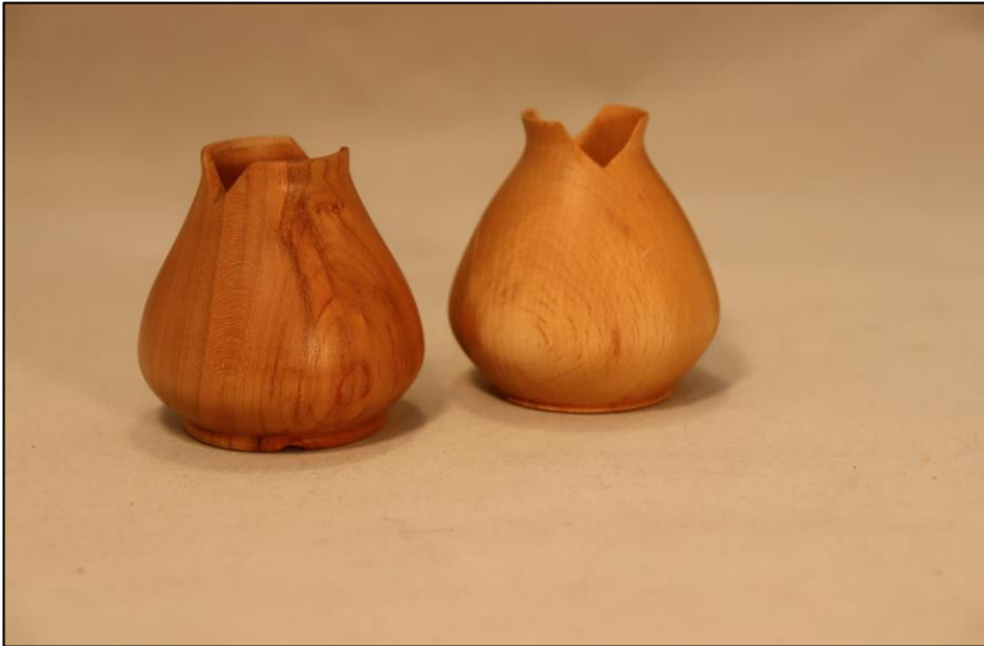
Left - Bruce Wick, small candle holders