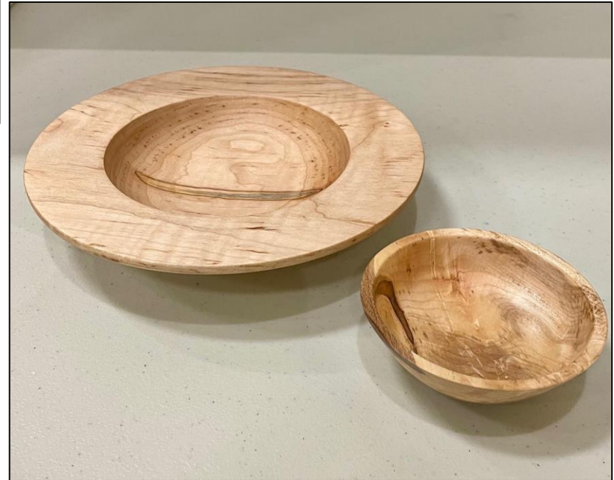
Left and Above