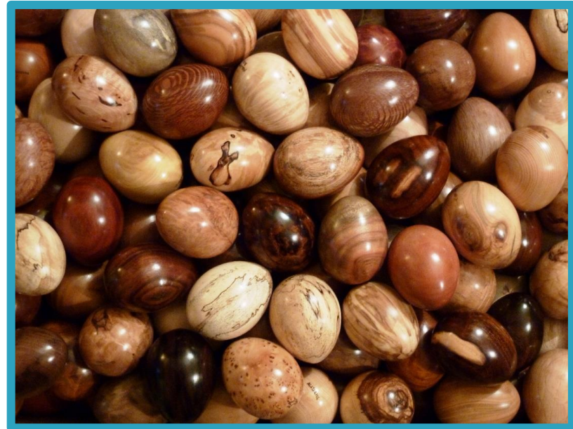
Dick Sing Wooden Egg Collection Photo

Chapter of the American Association of Woodturners