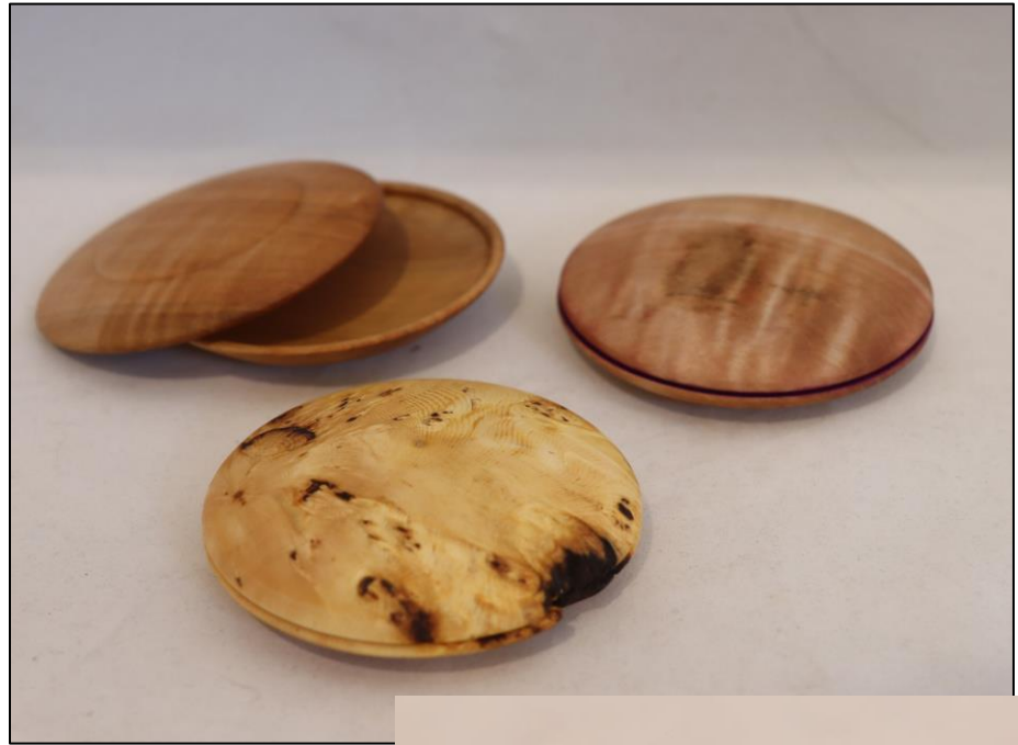
All This page - Rich Nye Clockwise: Clamshell Boxes; Blackwood Ring; Pocket mirrors; Bumblebee