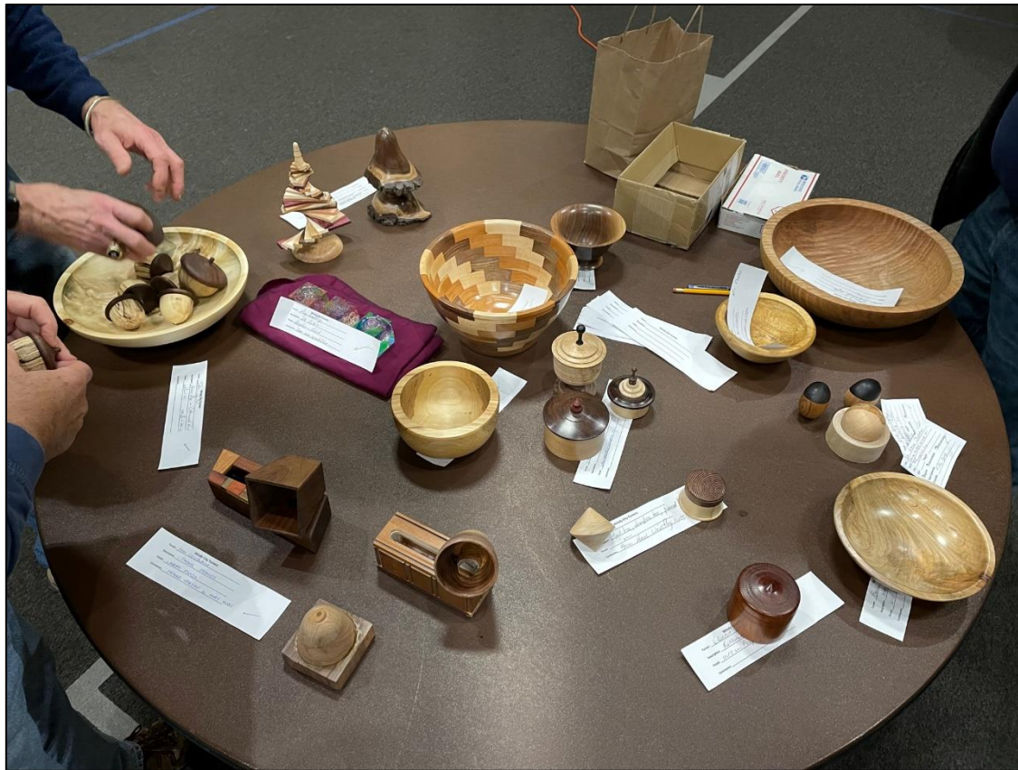
Above – some of the turned items for the Gallery Review