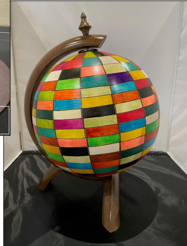
Below – Frank Pagura. Segmented Globe with Walnut stand