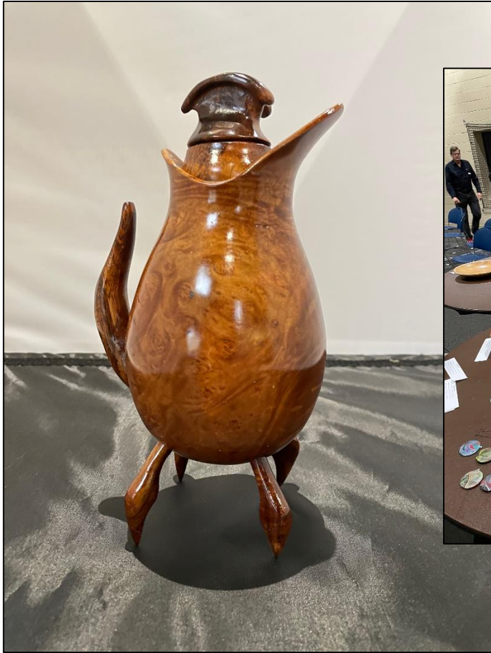
Above – Rich Nye Pitcher with special threaded Koa ring-box lid. Inspired from Rebecca DeGroot Classes.