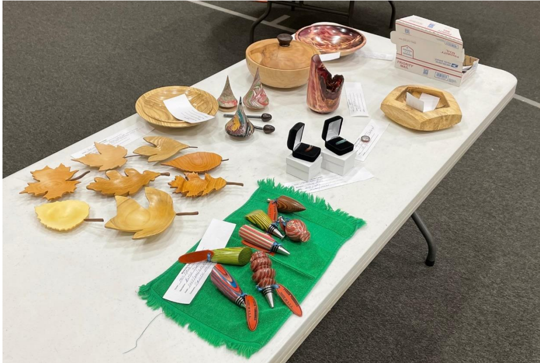
Above – some of the turned items for the Gallery Review