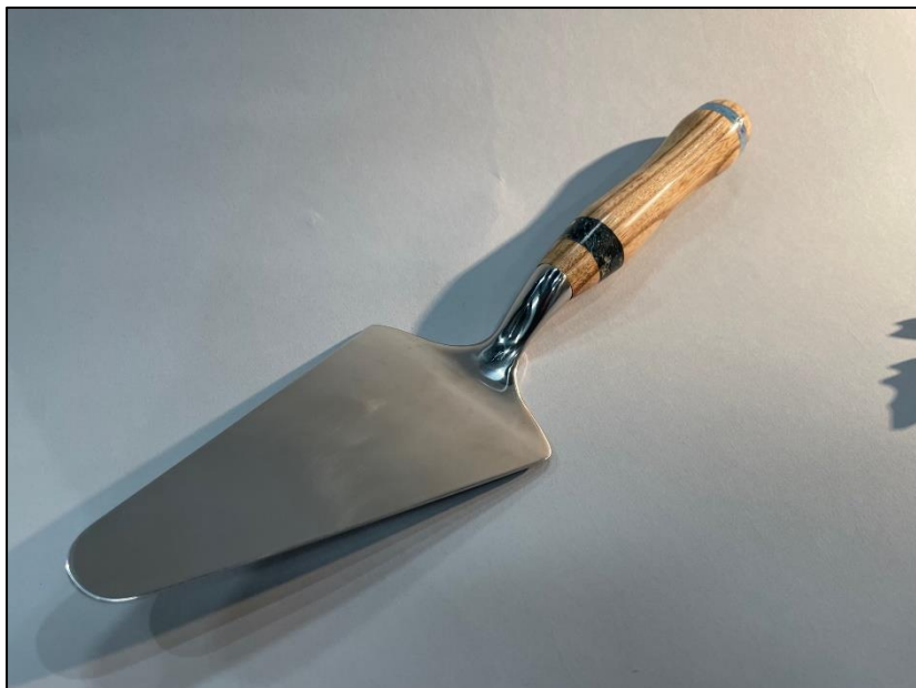
Left - Rich Hall-Reppen Pie Server