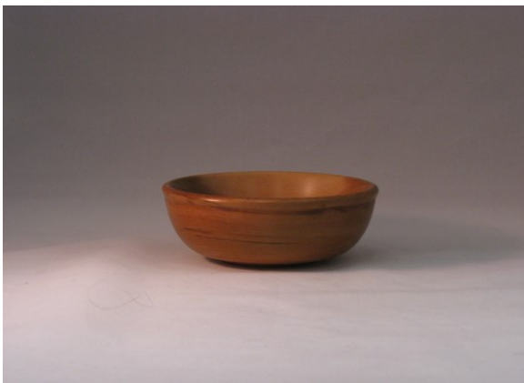
Ed Slee Cedar