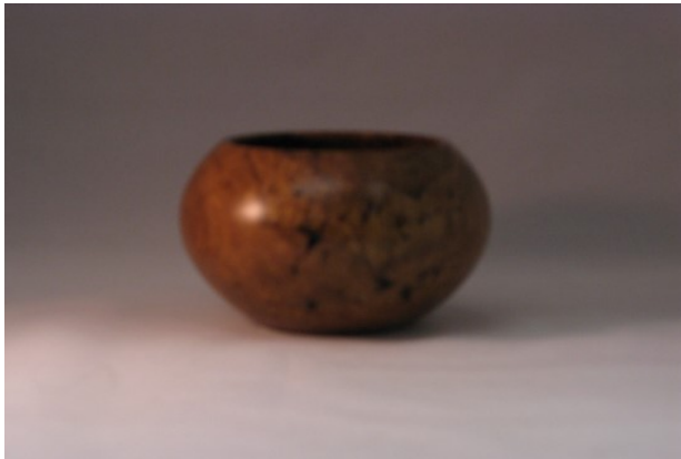
Dick Sing Oak burl