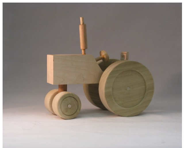
Bert Leloup Poplar