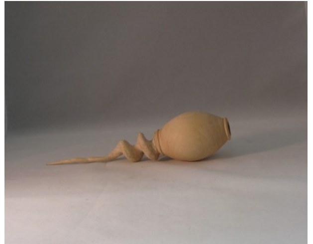
Rich Nye English Sycamore