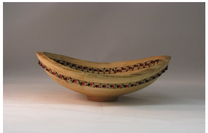
Paul Shotola Maple, Glass Beads