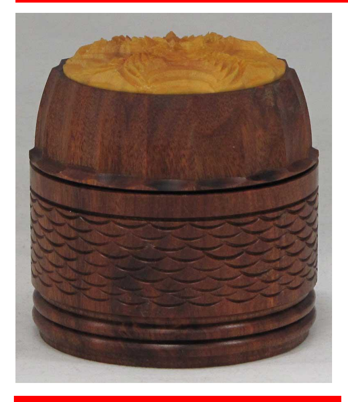
The November Gallery