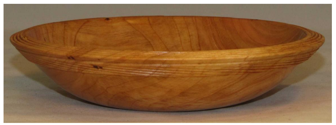
The November Gallery