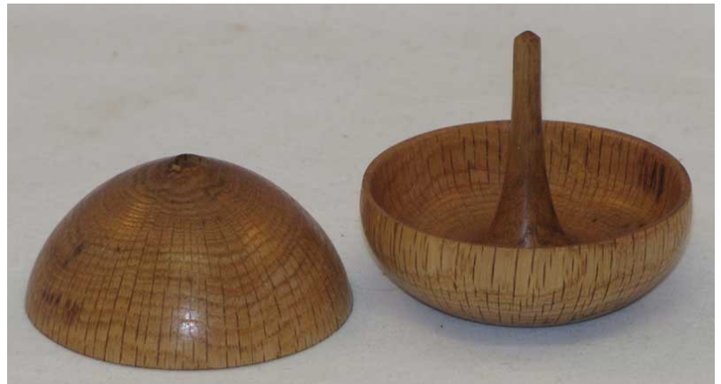
Rich Nye Oak