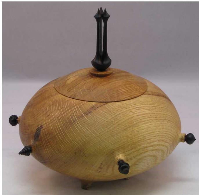
Rich Nye Oak, Blackwood