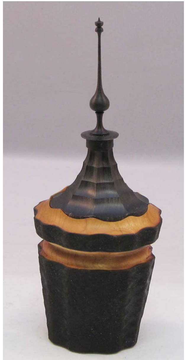
Rich Nye Cherry