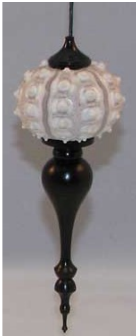
Dawn Herndon-Charles Sea Urchins, Blackwood