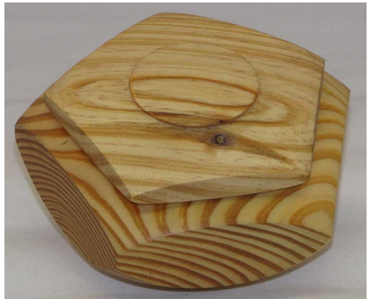
Paul Shotola Construction Pine