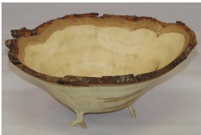
Rich Nye Maple