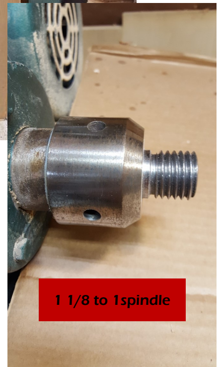
1 1/8 to 1 spindle