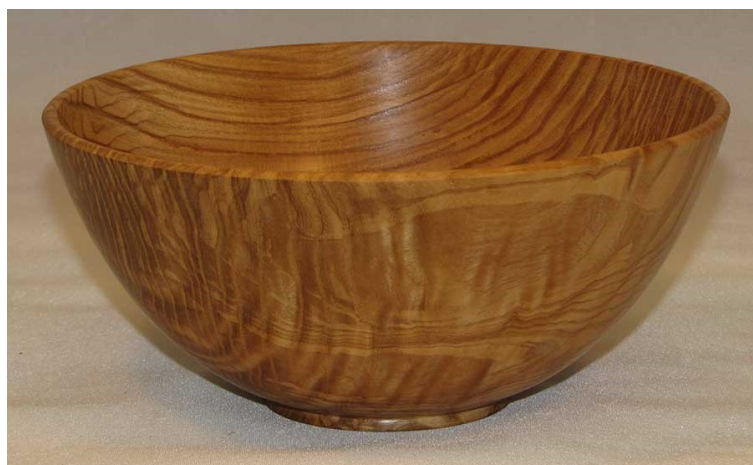
Dick Sing Eucalyptus