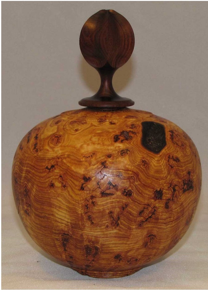
Rich Nye Aspen Burl