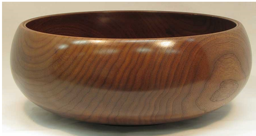
Bob Bergstrom Walnut