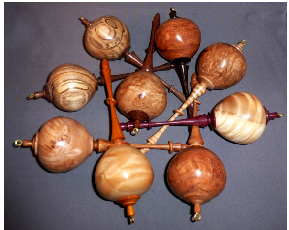
An array of hollow Christmas ornaments

Meetings are held the third Tuesday of each month from 7 pm till 9pm and we meet at the Lisle Park District, 1925 Ohio Street, Lisle IL. All are invited. At each meeting we feature a demonstration of wood turning techniques and have a showcase of members' current work. Guests and visitors are always welcome. Each month, members celebrating their birthday bring in some snacks, so there is always something good to eat. Is your birthday this month?