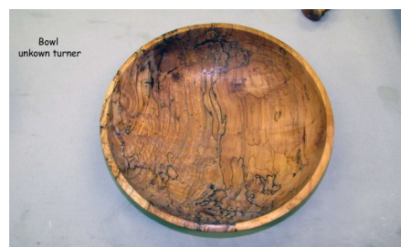
Bowl unkown turner