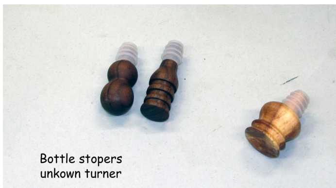
Bottle stopers unkown turner