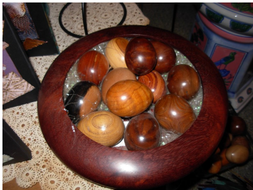
Bowl of turned Easter eggs of various woods. Always a crowd pleaser.

I have always tried to live by the old saying: "If it aint broke, don't fix it" but occa- sionally a new innovation comes along to change my mind. Dick Sing January 2015