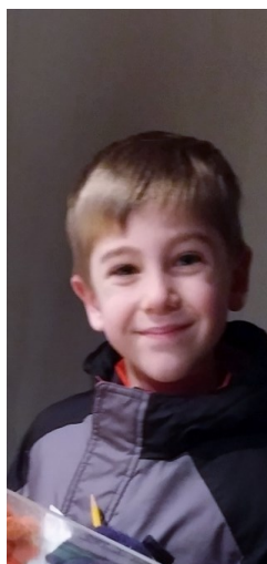
The kids were suitably impressed!