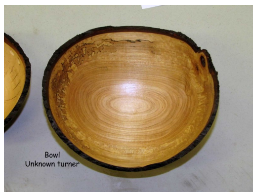
Bowl Unknown turner