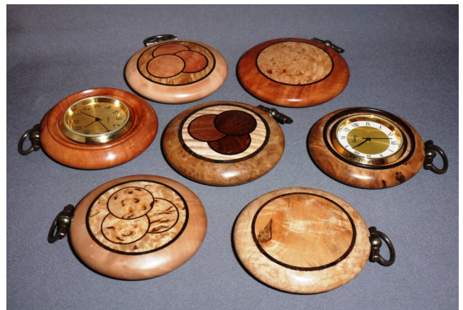
A collage of inlaid pocket watches