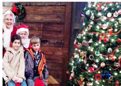
No Christmas festival is complete without a picture with Santa (and Mrs. Claus)