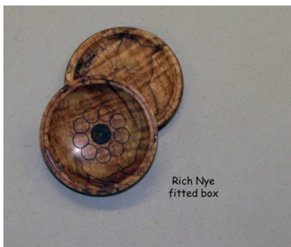
Rich Nye fitted box