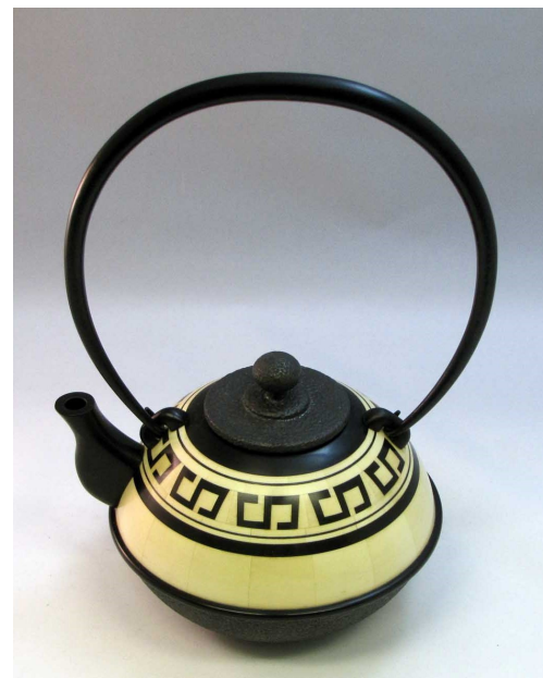
Al Miotke Ebony, Holly