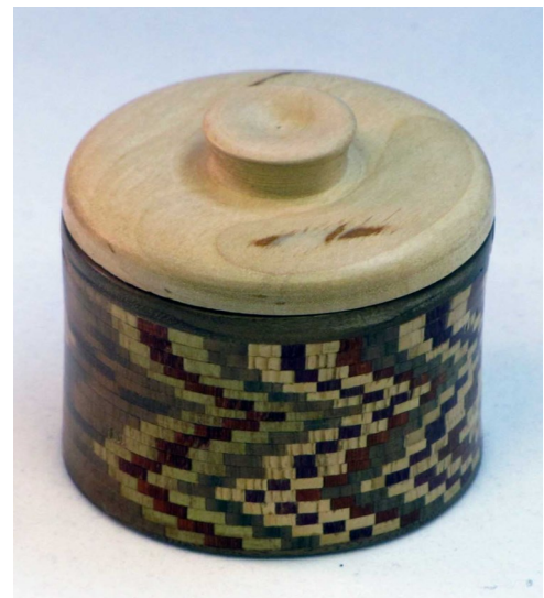
Bill Leloup Various Woods