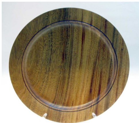
Len Swanson African Mahogany