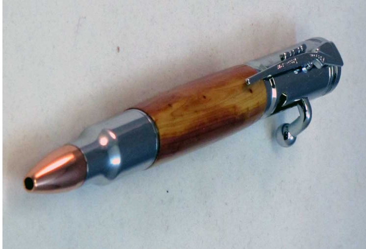
Phil Vitkus Juniper Burl