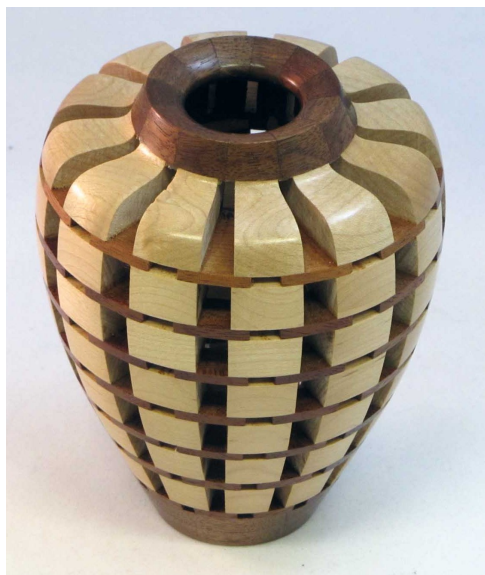
Earl Weber Maple, Walnut