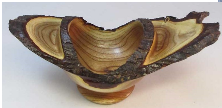
Collection of Paul Shotola