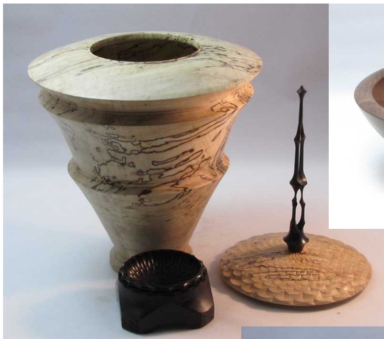
Rich Nye Maple, Blackwood