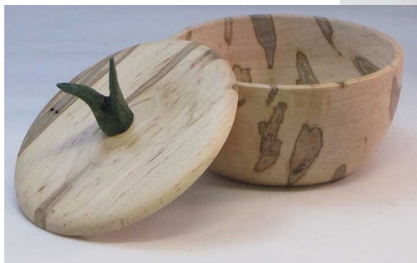
Bert LeLoup Ambrosia Maple