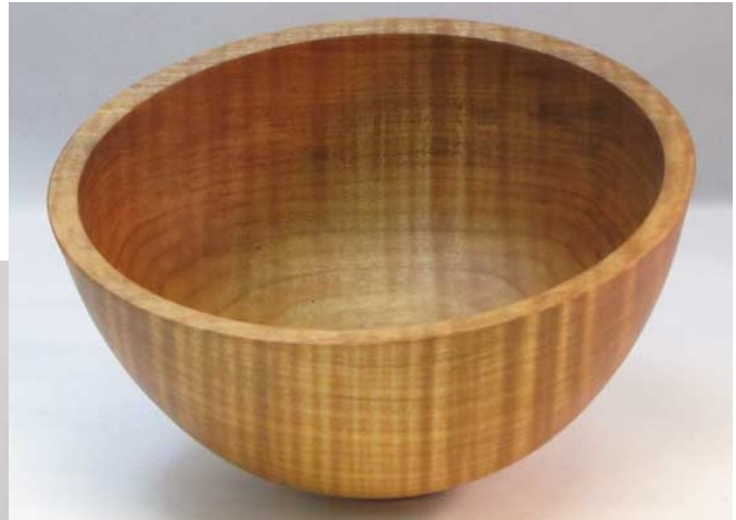
Rich Nye Maple