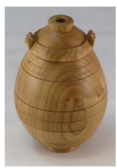
Rich Rohrbach Mesquite