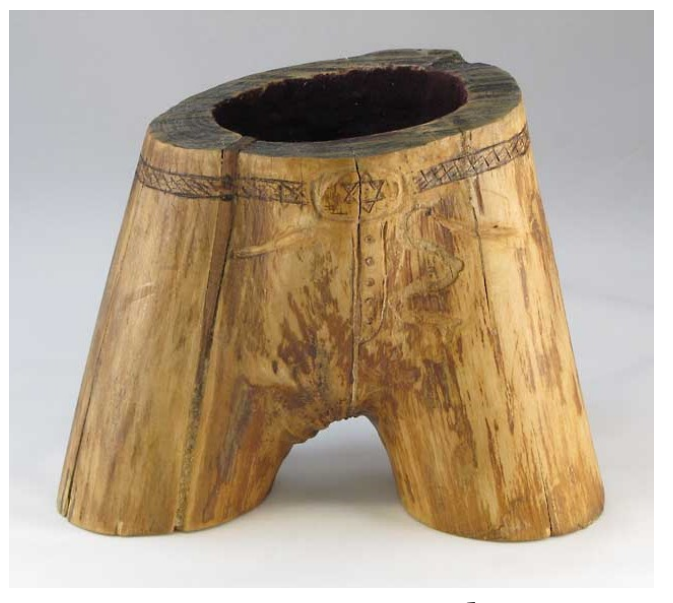
Bert LeLoup Ash