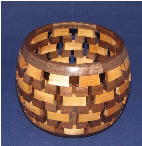
Ray Luckhaupt Walnut, Birch