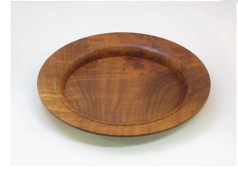
Dick Sing Mesquite