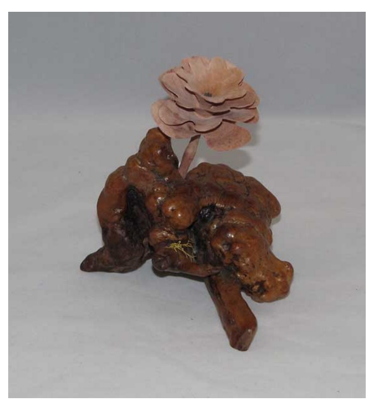
Ed Slee Cherry, Deft