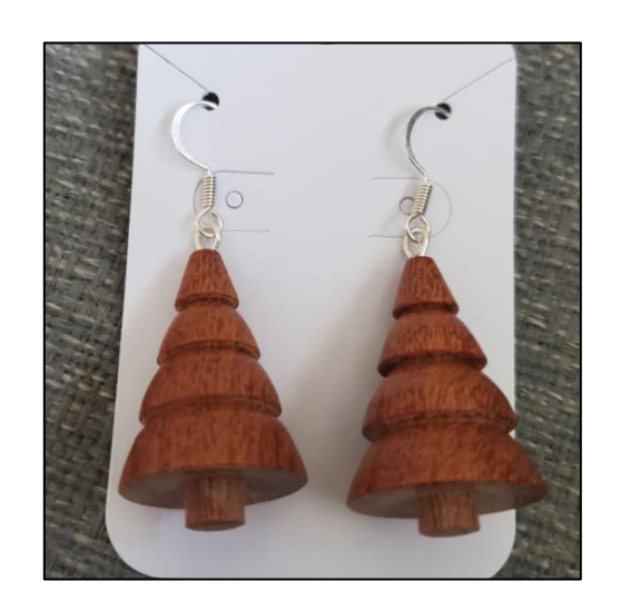
Earring examples made by Kurt