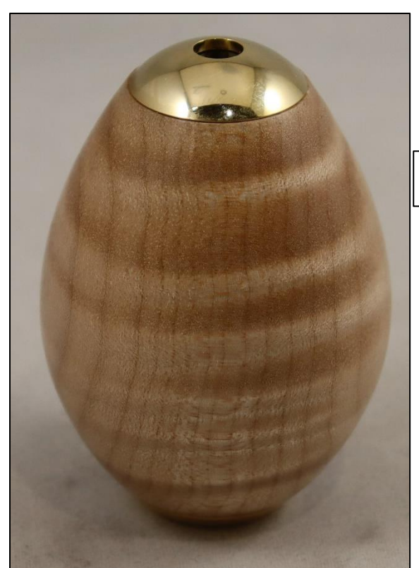
Left - Dick Sing