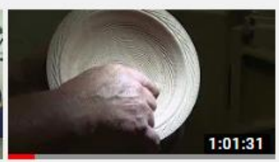
Secrets of Successful Texturing on Platters and...