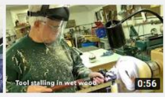
Lubricate the coring groove!