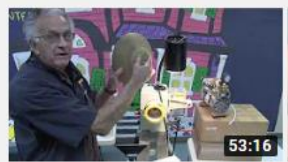
Using a Vacuum Chuck