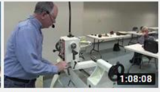
WAYS OF MOUNTING WOOD BLANKS