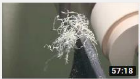
Turning a inlay in a inlay in a inlay