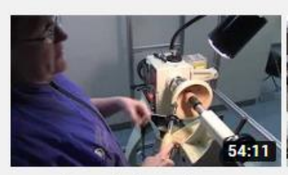
Texturing and Chattering Wood Surfaces