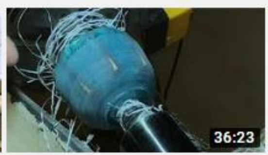
Turning a Turner's Star in Colored Resin