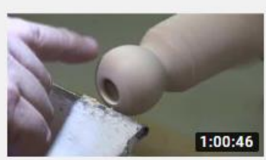
Turning a hollowed Christmas ornament with...