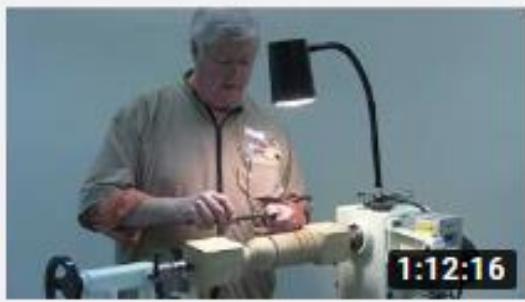
Replicating Spindle Turnings 192 views • 2 years ago