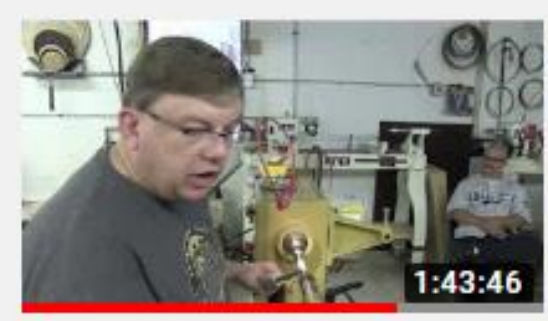
20 Years of Turning Pens