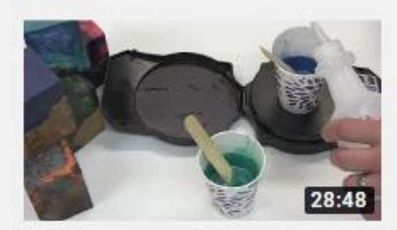
Casting Resins with Greg Bonier