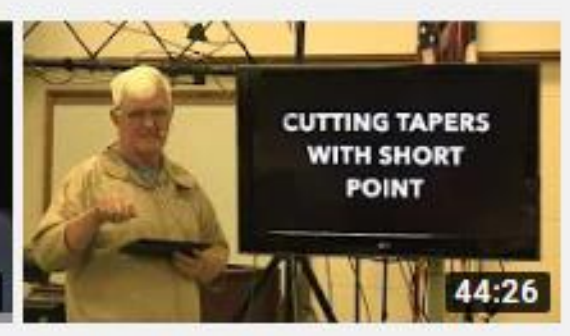
Analyzing the Skew