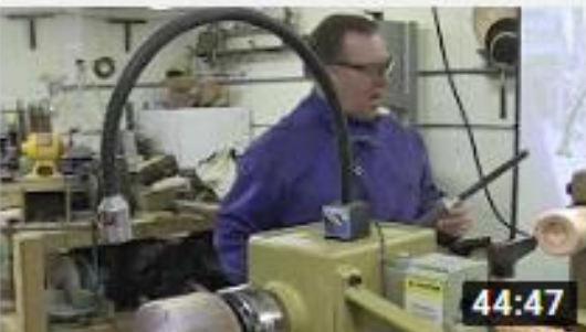
Different Cuts for Different Forks