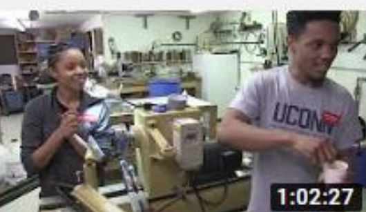
Threading Resin on Boxes