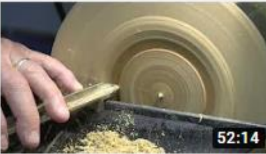
3 Major Bowl Grinds for the Iterior of bowls.