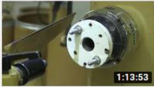
TURNING NATURAL EDGE BOWLS CLEANLY