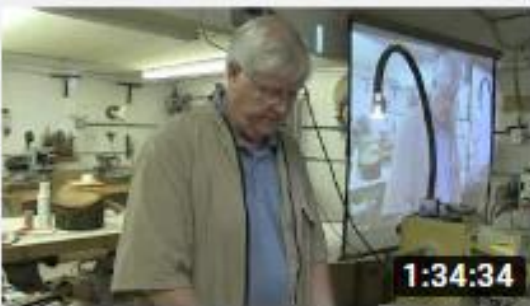
Designing and Turning Plates and Platters