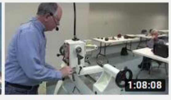
WAYS OF MOUNTING WOOD BLANKS