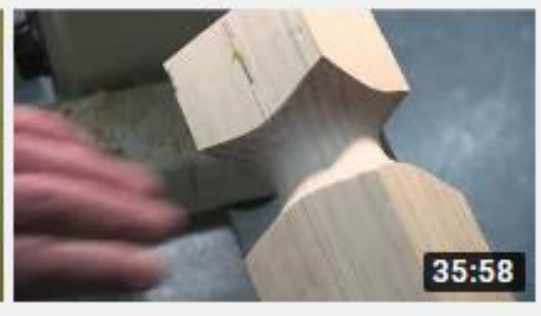
Ideas with Inside Out Turnings with Andy Kuby