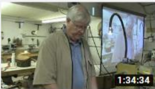
Designing and Turning Plates and Platters