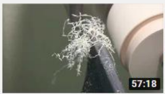
Turning a inlay in a inlay in a inlay