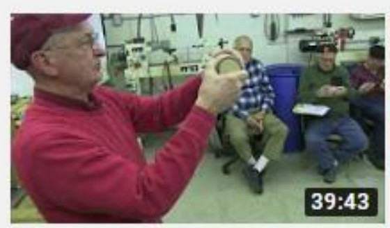
Beautiful Braclets from the lathe