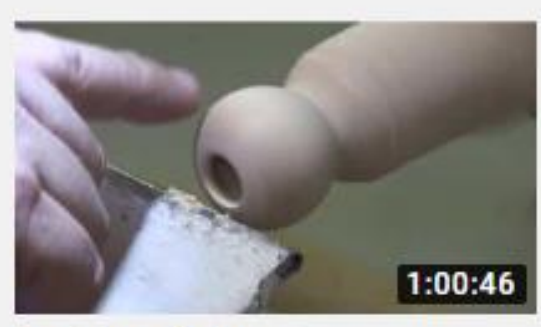
Turning a hollowed Christmas ornament with...