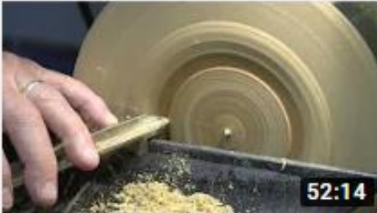
3 Major Bowl Grinds for the Iterior of bowls.