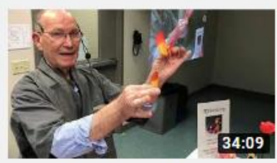
Roses for a Pretty Lady 199 views • 1 month ago