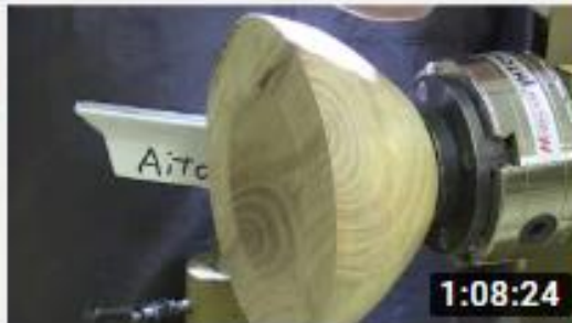
Duel Bowl Gouge Cuts