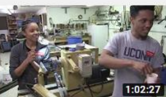
Threading Resin on Boxes