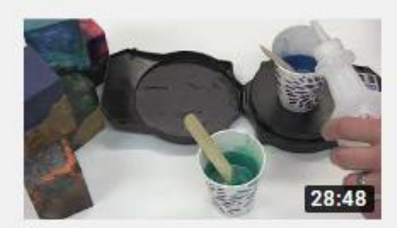
Casting Resins with Greg Bonier