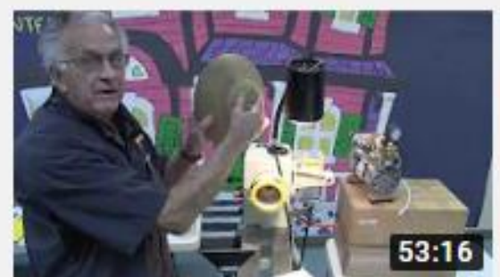
Using a Vacuum Chuck