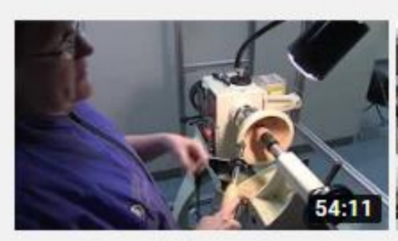
Texturing and Chattering Wood Surfaces