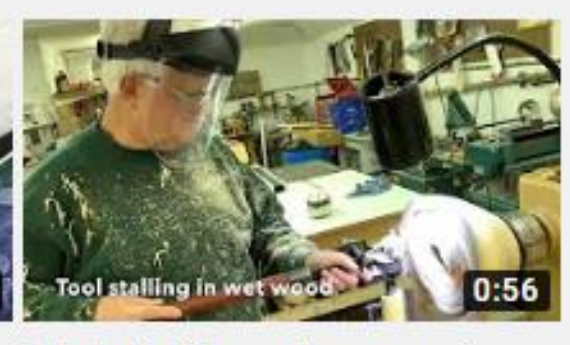
Lubricate the coring groove!