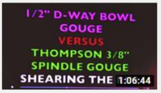
Using Spindle Gouges on Bowls