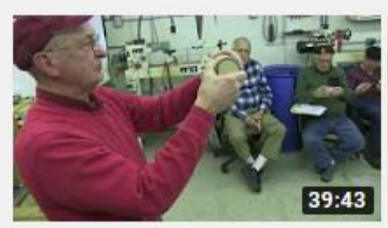
Beautiful Braclets from the lathe