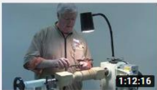
Replicating Spindle Turnings 192 views • 2 years ago