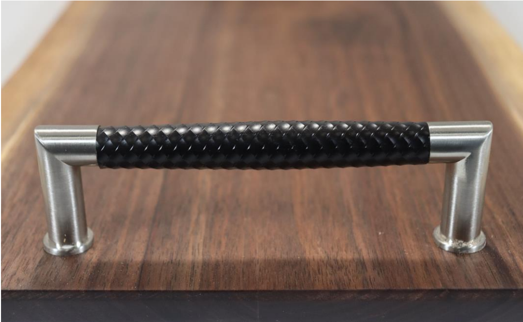
Left - Roy Lindley