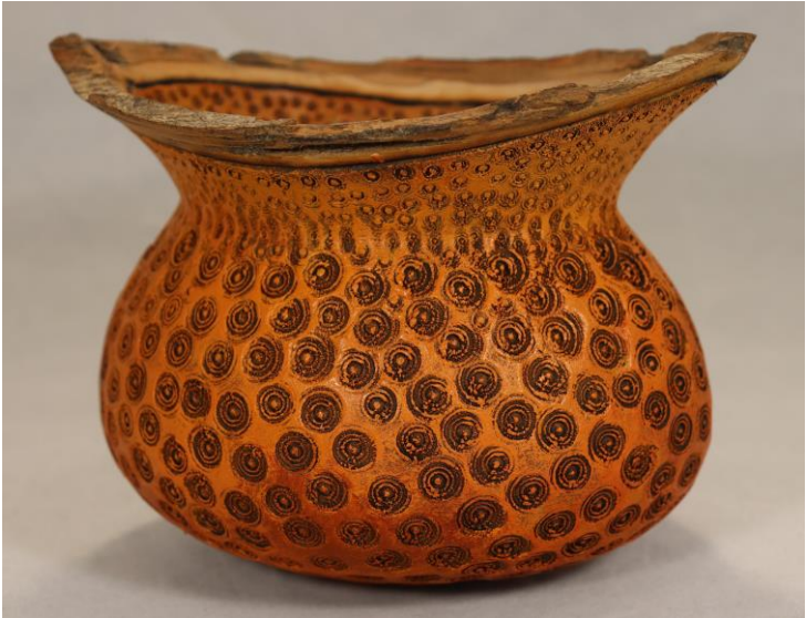
Above - Rich Nye