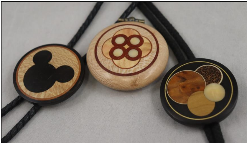
Below – Dick Sing