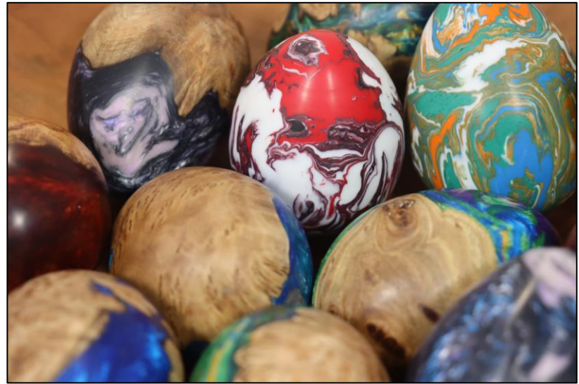
Eggs by Dick Sing