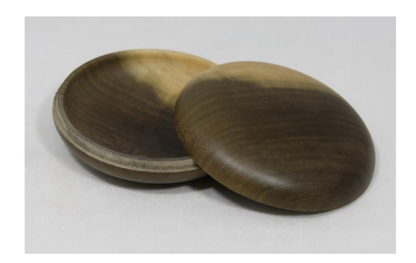
Above - Bruce Wick Clamshell Box