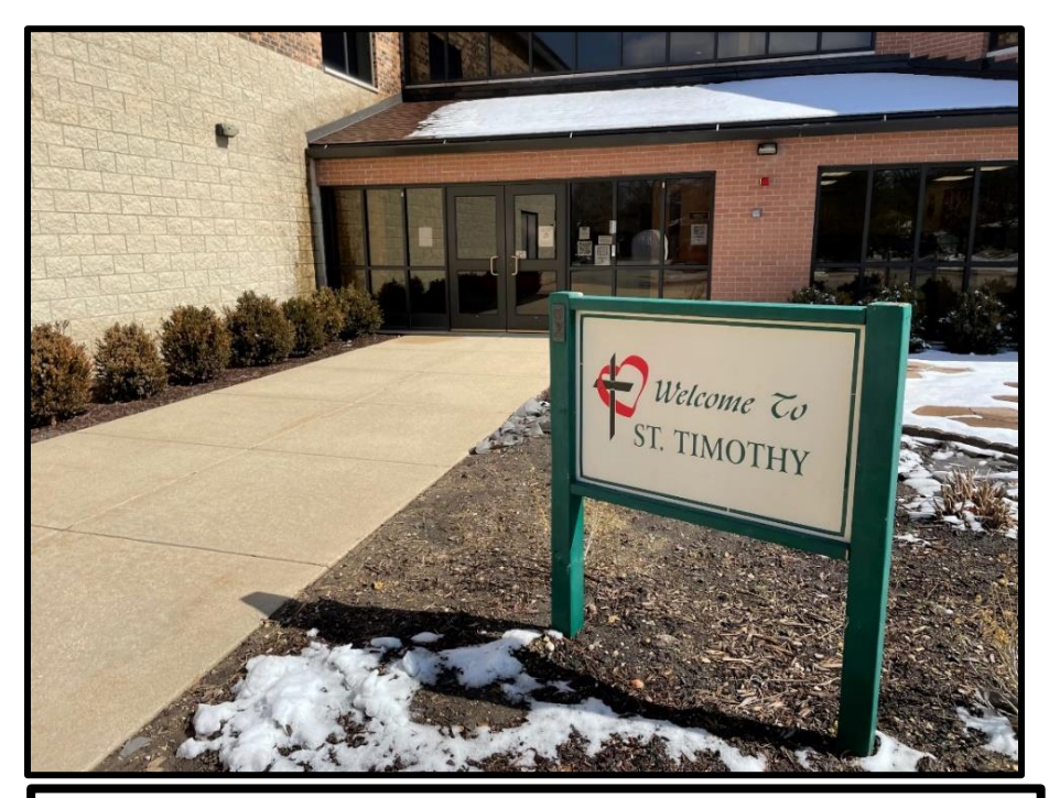
WCWT ENTRANCE - LOWER-LEVEL

PARKING IS ALSO IN THE BACK LOWER-LEVEL PARKING LOT