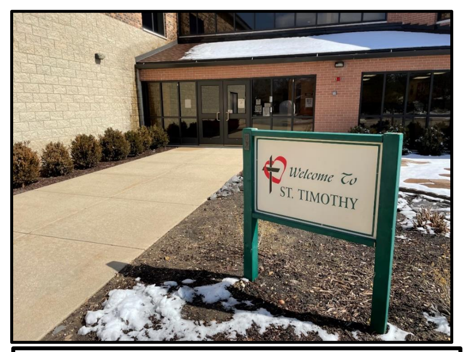
WCWT ENTRANCE - LOWER-LEVEL

PARKING IS ALSO IN THE BACK LOWER-LEVEL PARKING LOT