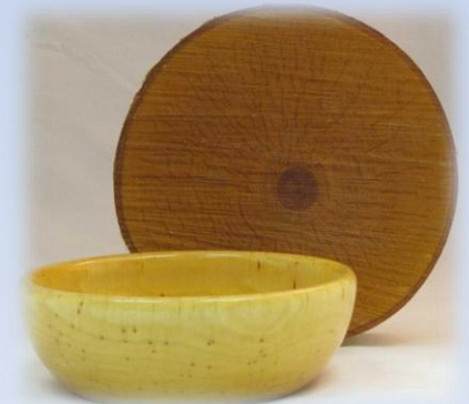
Bruce Kamp 9