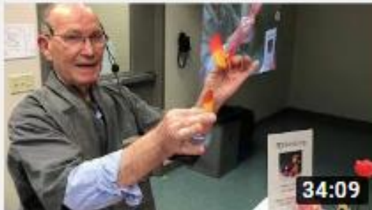
Roses for a Pretty Lady