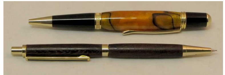
Bert Le Loup