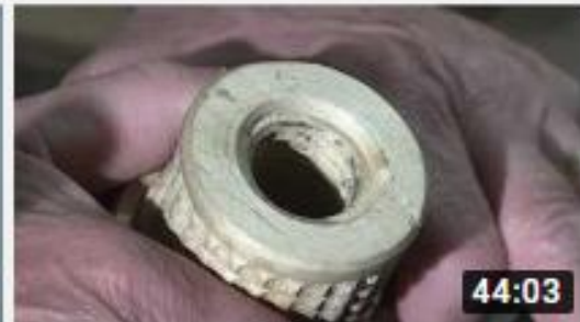
ANDY KUBY DEMOS THREADING ON VESSELS