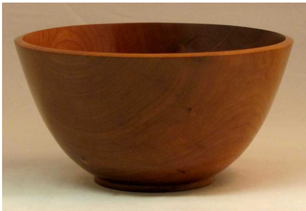
Dick Sing Bring Back