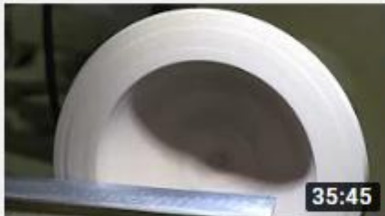
CUTTING THE INTERIOR LOWER THIRD OF A BOWL...