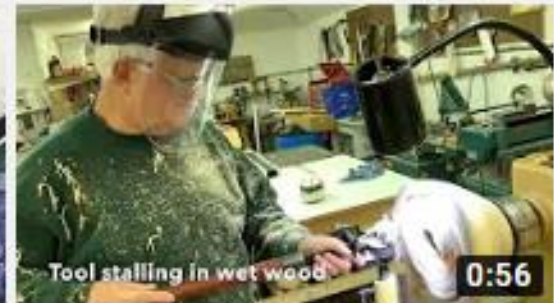
Lubricate the coring groove!