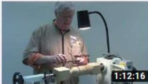
Replicating Spindle Turnings