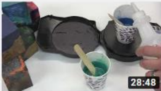
Casting Resins with Greg Bonier