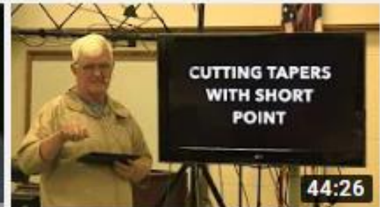
Analyzing the Skew